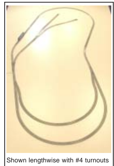
Shown lengthwise with #4 turnouts

Under standard DC operation, our recommendation would be to use the #6 turnouts.